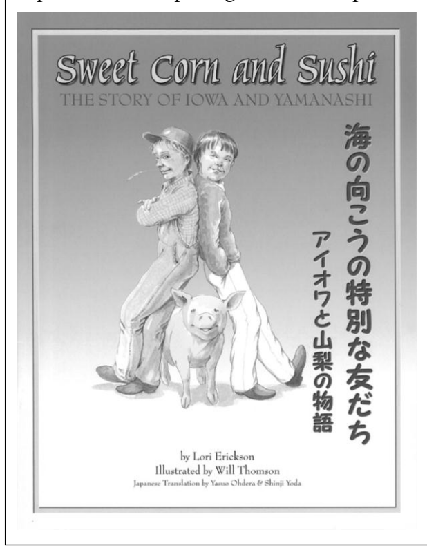
A picture book depicting the friendship between Iowa and Yamanashi